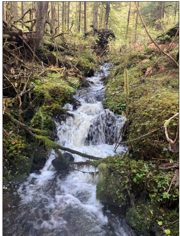
Figure 3.—Upstream view of stream with small falls at waypoint 1031.