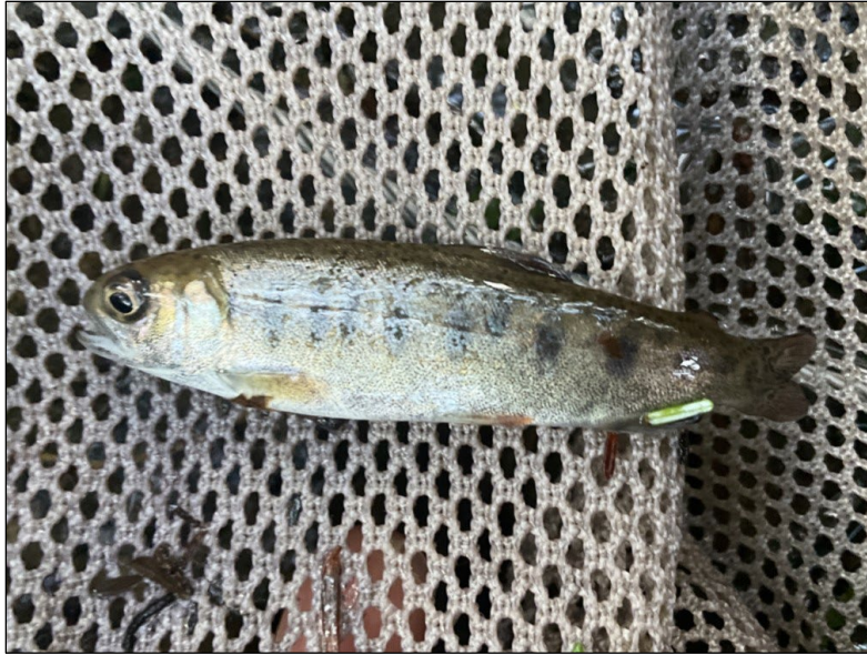
Figure 1.—Juvenile coho salmon captured at waypoint 1031.