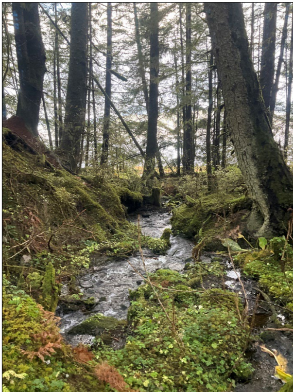
Figure 2.—Downstream view of stream at waypoint 1031.